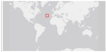
The boundaries and names shown and the designations used on this map do not imply any official endorsement, acceptance or opinion by IUCN.